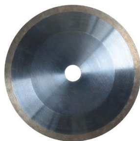
Diamond cut-off wheel